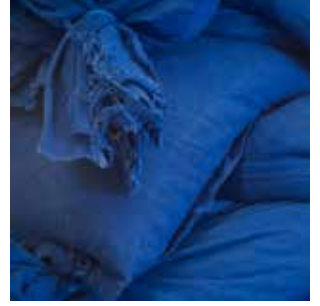
RGB,0,71,187 (Sandbags V.2) 2025 (detail) Alice Sheppard Fidler

James Merry creates intricate, nature-inspired jewellery drawing on flora and fauna.