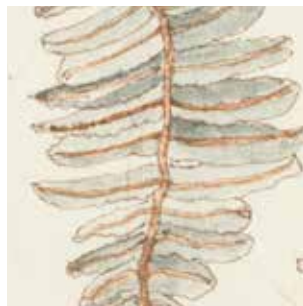
Time (time), 2025 (detail) Emily Lucas