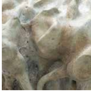
Not the Last (RSM) #2 (Road Side Memorail, 2017 (detail) Rachel Howard