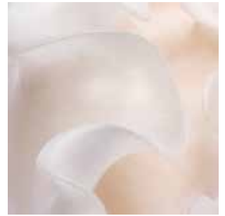
Chansigong, 2024 (detail) Kim Francis

'Stroud Sensation' showcases twelve Stroud-based artists, whose sculptural practices span multiple mediums.