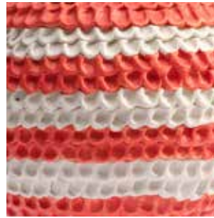
Impatient Vessels (Gourd), 2026 (detail) Lorraine Robbins