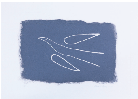
Bird in Grey, 2011 Breon O'Casey Carborundum

Two Standing Figures 1973, Lynn Chadwick, Lithograph Inverted Proof 2022, Jon Buck, Woodblock Print Goldilocks 2022, Jon Buck, Bronze Walking Cloaked Figures II 1978, Lynn Chadwick, Bronze